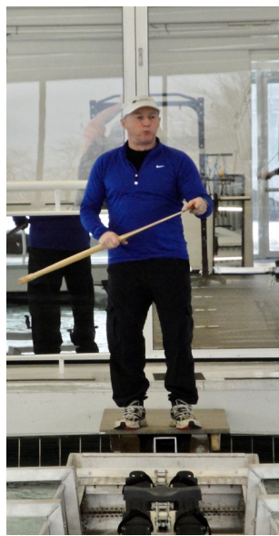
Winter Training at WIFC