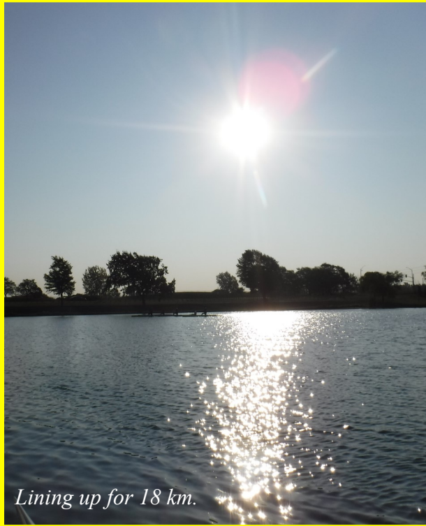
Lining up for 18 km.