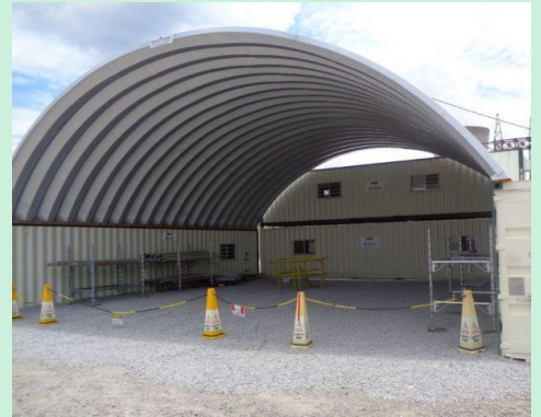
Image of a roof over shipping containers, similar to what SNCC is proposing.

Project Description: Convert existing fenced-in outdoor storage area into a 1,600 sq ft permanent outdoor all-weather recreational facility by installing a fixed and permanent canopy over the space and replacing existing gravel surface with durable permanent outdoor-quality cleanable flooring. The canopy will allow dryland training in a well-ventilated outdoor space with capacity for physical distancing during all types of weather. The flooring, intended for sport and recreation activities, is easily cleaned between uses. Key steps include: securing a building permit, selecting a project manager, installation of permanent canopy-style roof onto permanent storage units, completion of ground preparation, and installation of flooring.