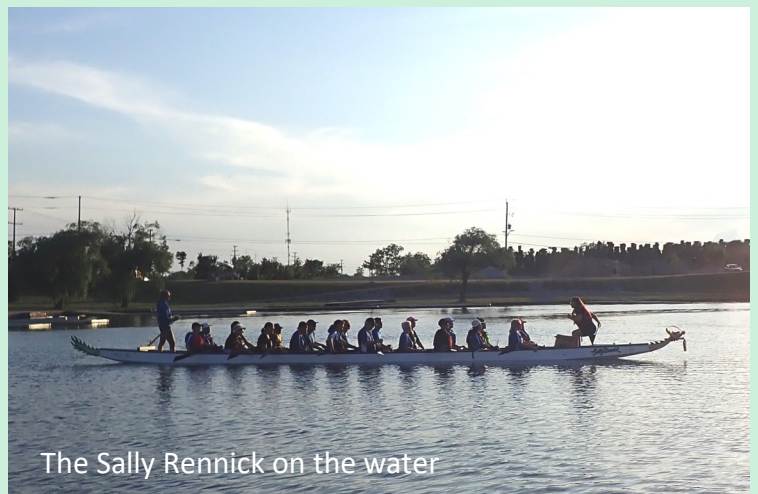
The Sally Rennick on the water