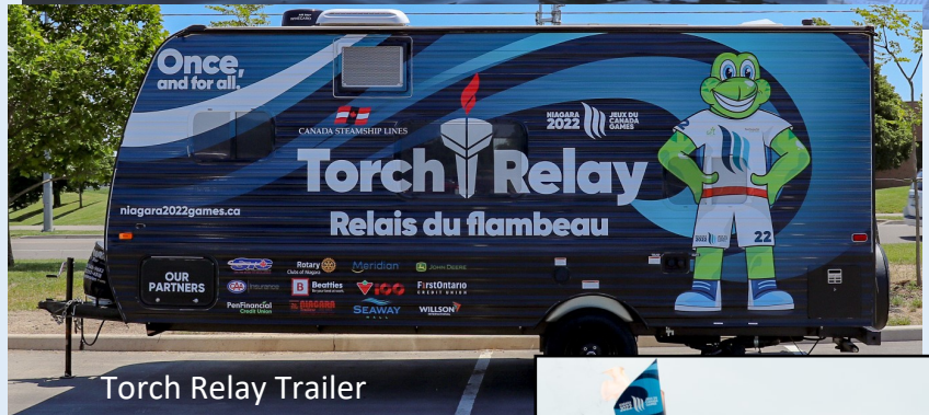
Torch Relay Trailer