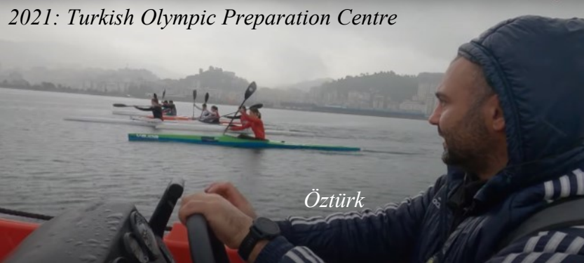
2021: Turkish Olympic Preparation Centre