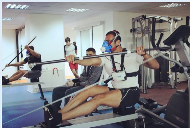
Left: 2015 - Performance tests for the team preparing for qualification races to the 2016 Rio de Janeiro Olympic Games.

from these, I work for my dreams and Being able to participate in the Olympic Games, known as the pinnacle of sports in the world, was one of my biggest dream in life. During my sports life, I was able to target the 2012 and 2016 Olympic Games. However, I could not get a quota in the European qualifying competitions. Now, as a coach, it has been my biggest dream and goal to raise an athlete who will participate in the Olympic Games. ■