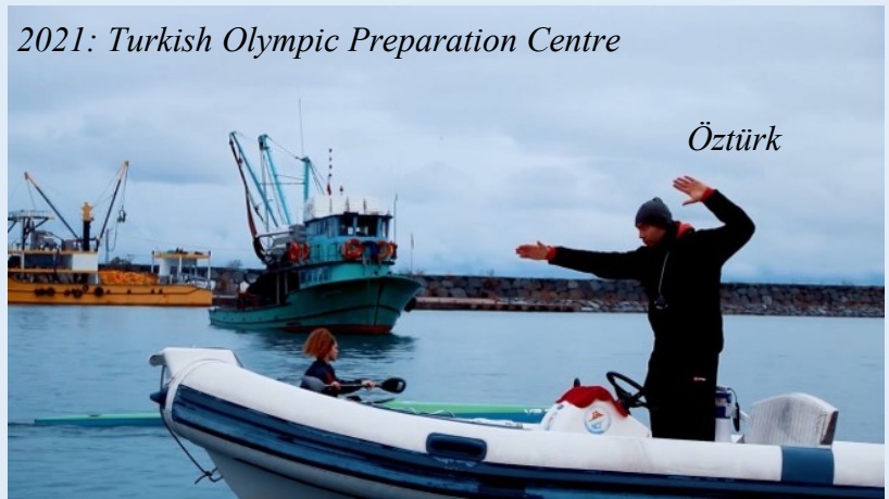
2021: Turkish Olympic Preparation Centre

◆ First of all, I see it as my first responsibility to share all my experiences about Canoe and Kayak, where I have had the opportunity to work with many country coaches and athletes for over 16 years, and everything I learned during my education in sports sciences. My short term goal is; To reach the general public in the Niagara region, to enable them to do paddling and to spread the sport to the grassroots. My long-term goal is; to train and develop performance athletes, to be a strong team that wins national competitions, and to train athletes to be selected for the national team.