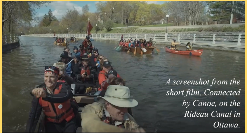
A screenshot from the short film, Connected by Canoe, on the Rideau Canal in Ottawa.

The canoe is not only an important part of Canada's past but our present and future as well. The canoe teaches us we are all "in the same boat" and by "pulling together," Canadians of all backgrounds, regions and beliefs can build an equitable, sustainable and inclusive future for Canada.