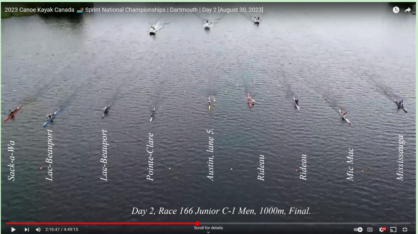
Day 2, Race 166 Junior C-1 Men, 1000m, Final.