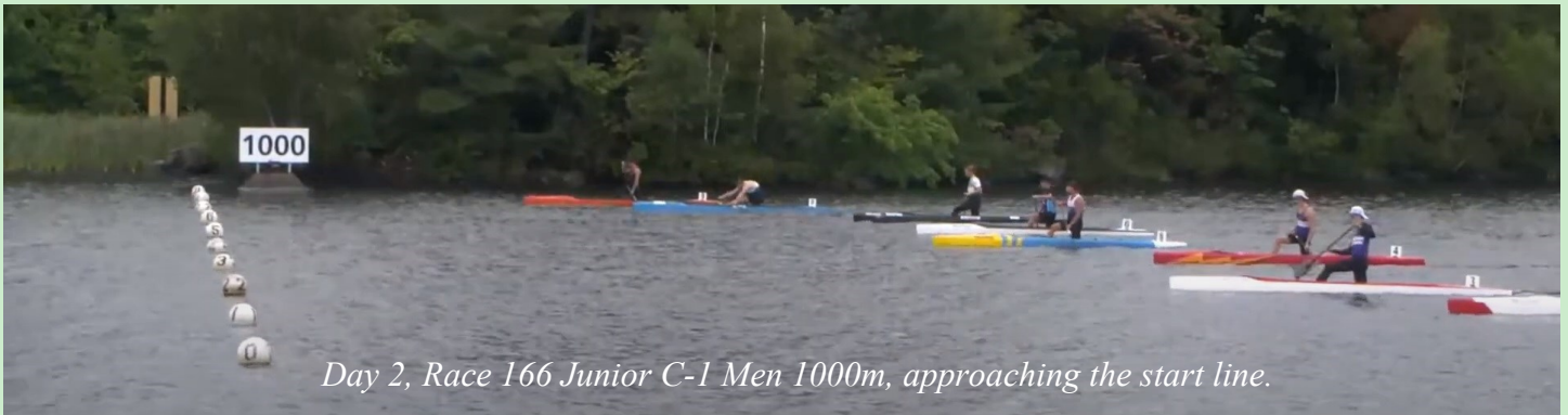
Day 2, Race 166 Junior C-1 Men 1000m, approaching the start line.