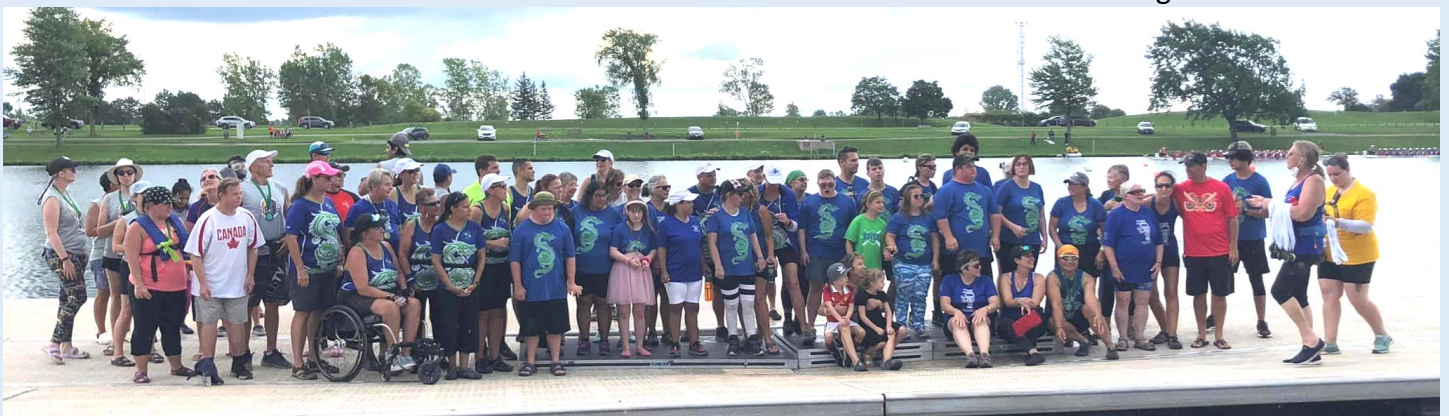
Canal Dragons—Special Needs Crew. Their first ever regatta! Congratulations!