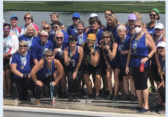
Hope Floats, Canal Dragons BCS crew win gold.