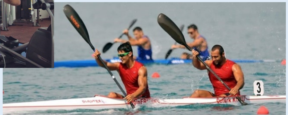
Right: 2013 XVII Mediterranean Games Turkiye, K2, 1000m, 4th place by a split second.