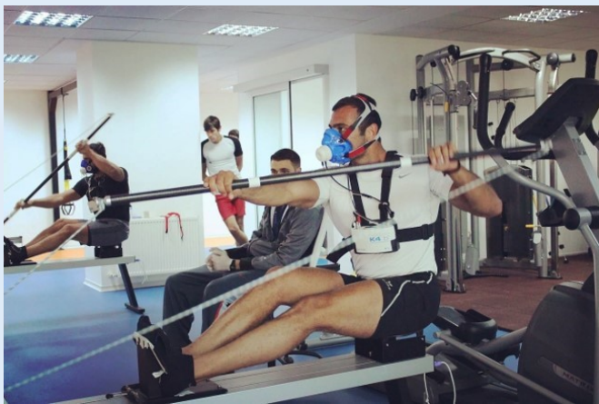
Left: 2015 - Performance tests for the team preparing for qualification races to the 2016 Rio de Janeiro Olympic Games.

from these, I work for my dreams and Being able to participate in the Olympic Games, known as the pinnacle of sports in the world, was one of my biggest dream in life. During my sports life, I was able to target the 2012 and 2016 Olympic Games. However, I could not get a quota in the European qualifying competitions. Now, as a coach, it has been my biggest dream and goal to raise an athlete who will participate in the Olympic Games. ■