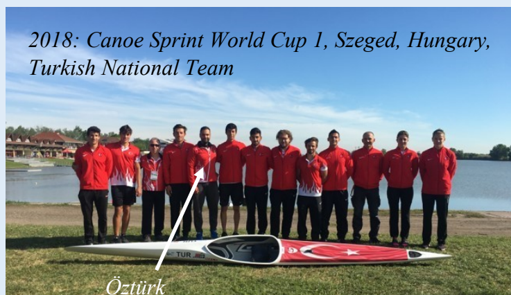
2018: Canoe Sprint World Cup 1, Szeged, Hungary, Turkish National Team

◆ My 10-year national athlete life and my team captainships came to an end when I could not get an Olympic quota from Europe in 2016. After the Federation presidency elections held in December 2016, the presidency and management of the Turkish Canoe Federation deemed me suitable for the Sprint canoe kayak technical committee membership. The development reports, short and long-term plans and reports I prepared during the technical committee membership that I started in January 2017 attracted attention. In March 2017, I signed a contract with the Turkish Canoe Federation to develop the infrastructure for the advancement of canoe and kayak in Turkey, to train trainers and athletes in different cities, and to employ the young national team staff, and I started coaching.