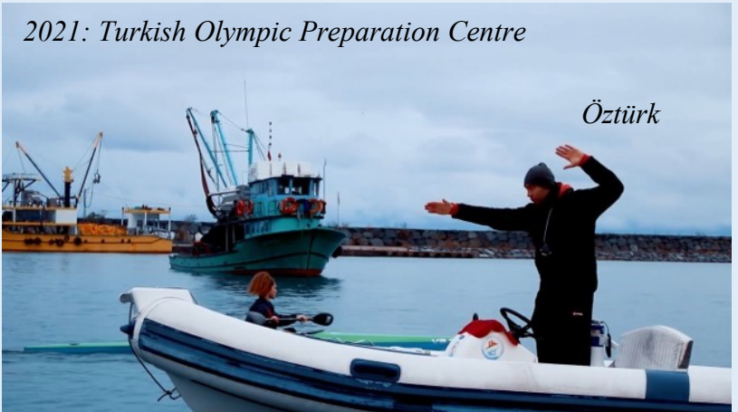
2021: Turkish Olympic Preparation Centre

◆ First of all, I see it as my first responsibility to share all my experiences about Canoe and Kayak, where I have had the opportunity to work with many country coaches and athletes for over 16 years, and everything I learned during my education in sports sciences. My short term goal is; To reach the general public in the Niagara region, to enable them to do paddling and to spread the sport to the grassroots. My long-term goal is; to train and develop performance athletes, to be a strong team that wins national competitions, and to train athletes to be selected for the national team.