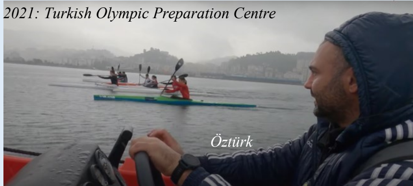
2021: Turkish Olympic Preparation Centre